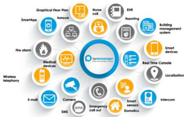
IQ Messenger's large ecosystem