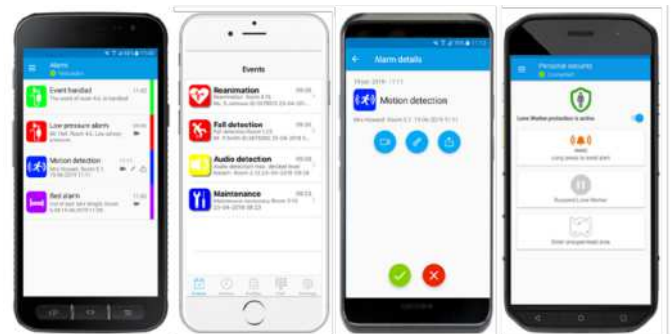
SmartApp graphical interface

A smartphone and tablet application named SmartApp is available for Android OS and iOS to manage critical alarms with contextual information. This includes video observation and clinical personal security (using lone worker protection, panic button and immobility detection mechanisms.) To ensure critical alarm notifications, the SmartApp overrides the smartphone silent mode (even on iOS devices) and generates warning audio tones when the coverage doesn't allow the server connection.