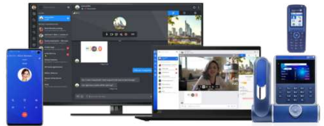
Alcatel-Lucent collaboration services and phones